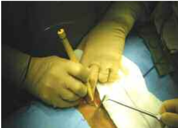
Figure 3. Skin incision. A 3- to 5-cm incision is made along the 11th rib without rib resection.

resection. The kidney is exposed from pole to pole and from its greater curvature to the hilum both anteriorly and posteriorly (Figure 4). The ureter and its attachments are exposed and stapled with an ETS-Flex (Ethicon, Inc, Somerville, NJ, USA) endoscopic articulating linear cutter (Figure 5). The articulating linear cutter applies 3 staple lines proximally and 3 distally and has a flexible and rotating end (Figure 6,7). The ETS-Flex can be used to transect the gonadal vein (Figure 8). After the hilum has been cleaned so that only the renal vein and renal artery remain, these vessels are stapled with the ETS-Flex cutter (Figure 9,10,11). This technique allows enough space for the fingers to dissect the kidney, and therefore, we called it the finger-assisted technique as compared with the hand-assisted laparoscopic technique. By the end of the procedure, the size of the incision is the same as when we started (Figure 12).