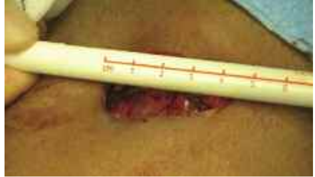
Figure 12. The incision measures 4.5 cm after completion of the nephrectomy.

Data are presented as means \pm standard deviation or median with range where appropriate.