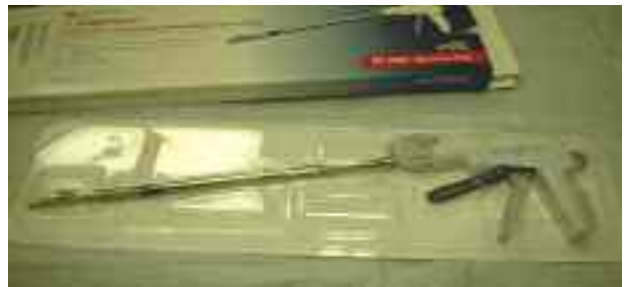
Figure 6. Use of the ETS-Flex endoscopic articulating linear cutter. The articulating linear cutter applies 3 staple lines proximally and 3 distally. The cutter has a flexible and rotating end.