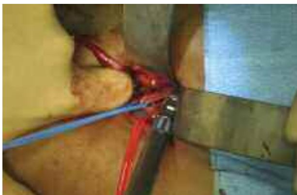
Figure 11. Transection of the renal vein.