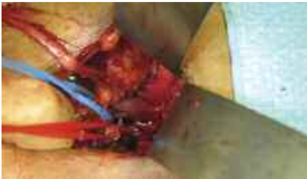
Figure 9. Exposure of the vessels. After the hilum has been cleaned so that only the renal vein and renal artery remain, these vessels are stapled with the ETS-Flex cutter.