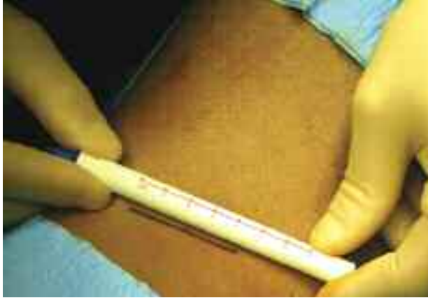
Figure 2. Position and incision. On the operating table, the patient is rolled into the lateral position with the tip of the 11th rib directly overlying the flexed part of the operating table. After the patient is secured, the table is flexed to allow the greatest possible separation between the iliac crest and the lower costal margin.