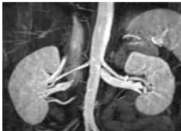
Figure 1. Magnetic resonance angiography of the kidneys.

All donors undergo a magnetic resonance angiography (MRA) prior to the nephrectomy (Figure 1). The patient is positioned in the lateral decubitus position with the table maximally flexed (Figure 2). An initial 4.0-cm transverse incision is made anterior to the 11th rib (Figure 3). All muscle layers are cut in the line of the incision, without rib