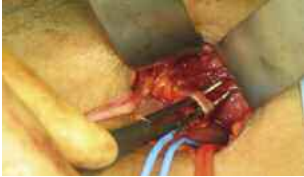
Figure 8. The gonadal vein.