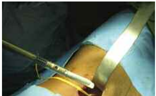
Figure 5. Identification of the ureter. The ureter and its attachments are exposed and stapled with the ETS-Flex endoscopic articulating linear cutter.