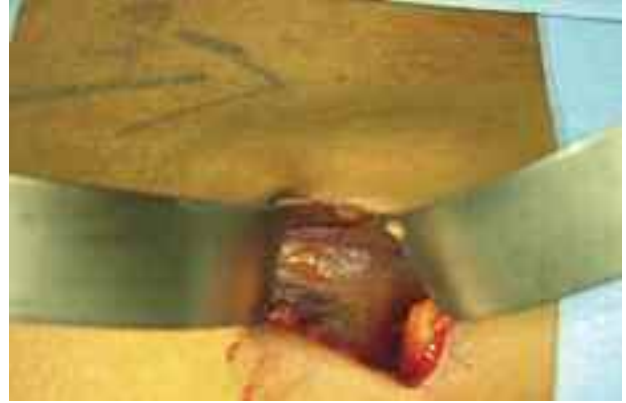
Figure 4. Exposure of the kidney. The kidney is exposed from pole to pole and from its greater curvature to the hilum both anteriorly and posteriorly.

resection. The kidney is exposed from pole to pole and from its greater curvature to the hilum both anteriorly and posteriorly (Figure 4). The ureter and its attachments are exposed and stapled with an ETS-Flex (Ethicon, Inc, Somerville, NJ, USA) endoscopic articulating linear cutter (Figure 5). The articulating linear cutter applies 3 staple lines proximally and 3 distally and has a flexible and rotating end (Figure 6,7). The ETS-Flex can be used to transect the gonadal vein (Figure 8). After the hilum has been cleaned so that only the renal vein and renal artery remain, these vessels are stapled with the ETS-Flex cutter (Figure 9,10,11). This technique allows enough space for the fingers to dissect the kidney, and therefore, we called it the finger-assisted technique as compared with the hand-assisted laparoscopic technique. By the end of the procedure, the size of the incision is the same as when we started (Figure 12).