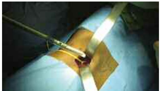
Figure 7. Transection of the ureter.