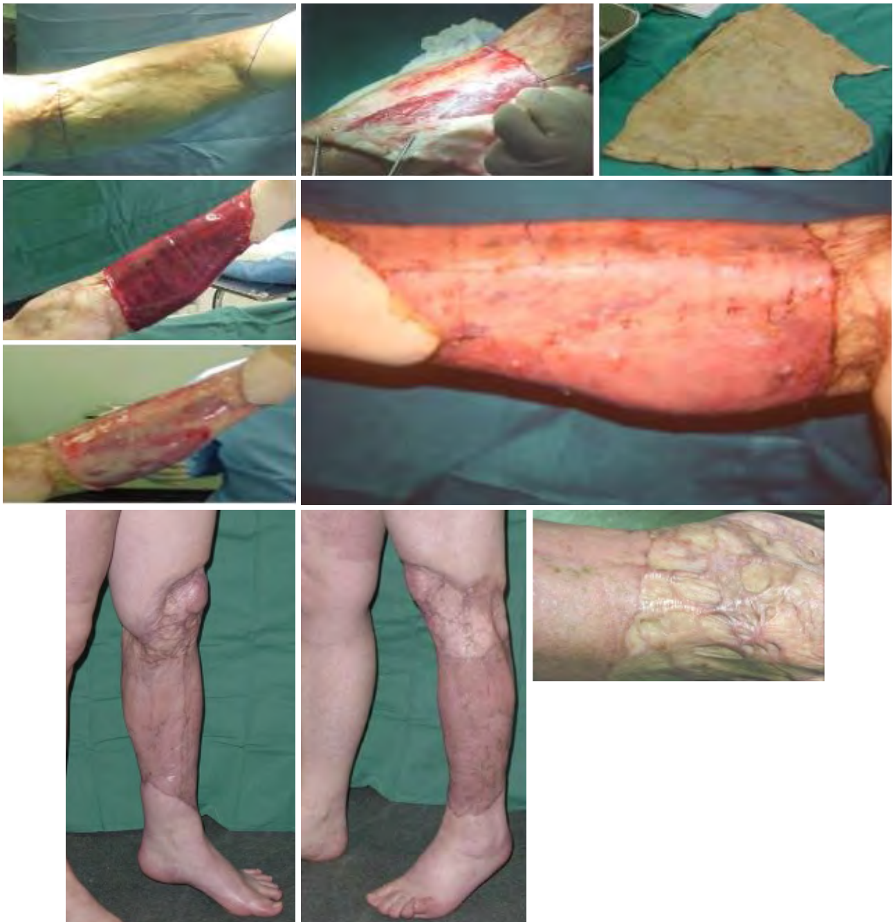
FIGURE 5. Management of Burn Sequelae With Integra Acellular Matrix + Autologous Skin Graft

Bottom images compare scar with (left) and without (right) the use of Integra.