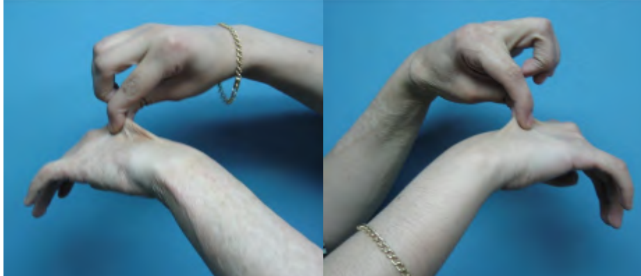
(Left) Integra acellular matrix + skin graft. (Right) Native skin.