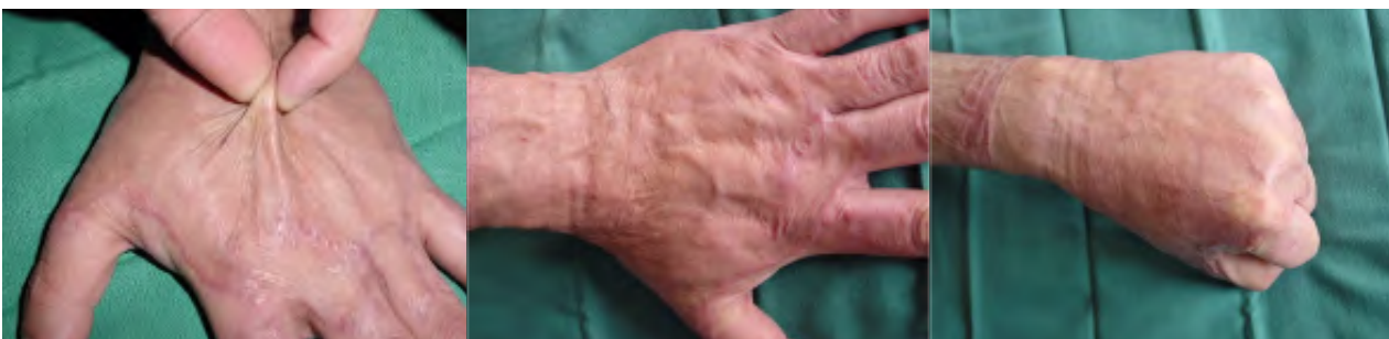
FIGURE 10. Postoperative Results of Management of Burn Injury to Hand With Integra Showing Next-to-Normal Skin Pliability