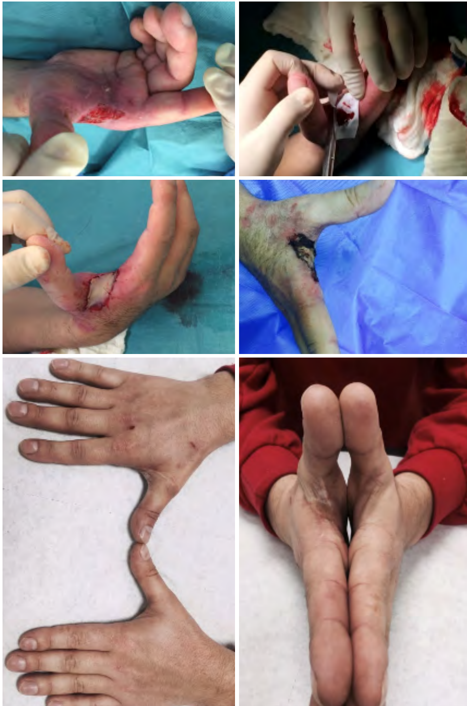
FIGURE 3. Use of Matriderm Acellular Matrix in Management of Acute Burn

regeneration as it allows fibroblastic invasion. It can be combined with autologous skin grafting for improved functionality over grafting alone. An example of its use is shown in Figure 3 and Figure 4.