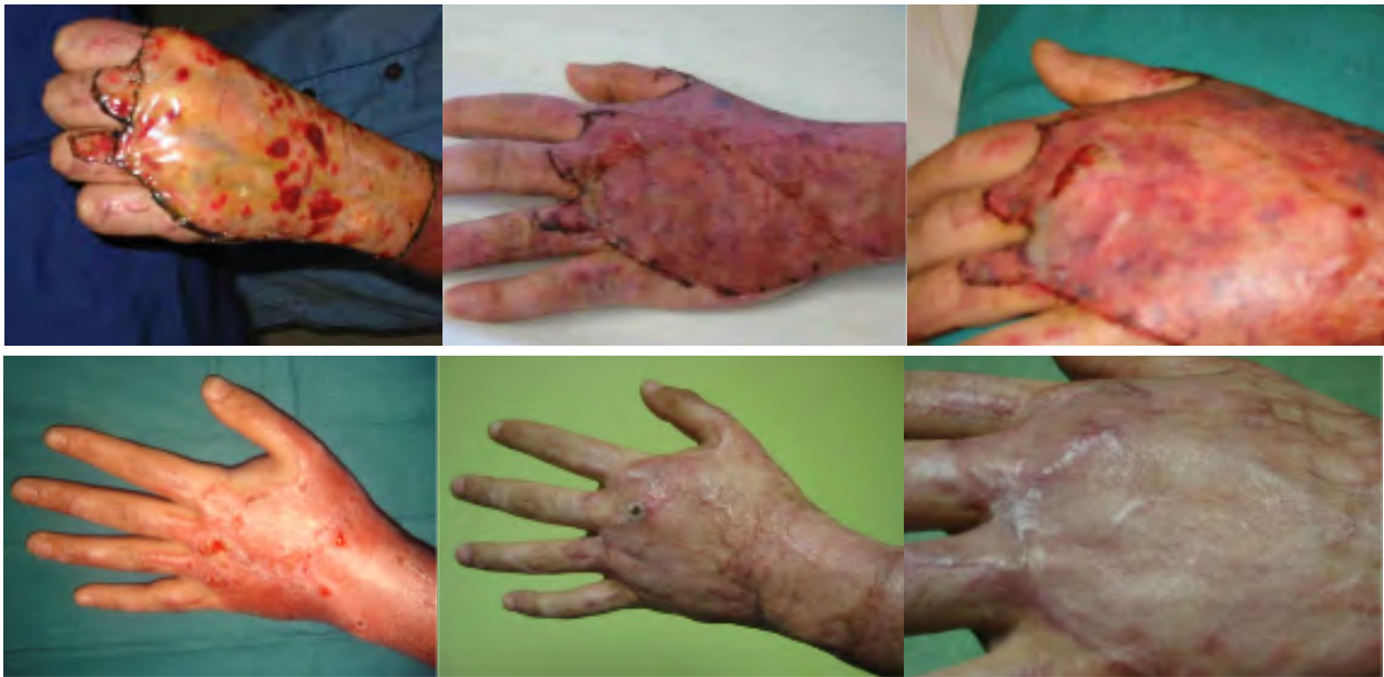
Shown left to right are intraoperative images with Integra in situ, dermoepidermal graft on postoperative day 4, postoperative day 12, postoperative day 29, postoperative month 3, and postoperative month 4.