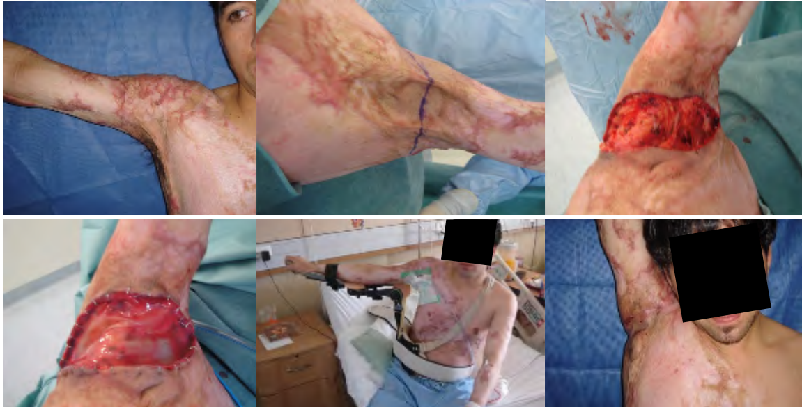
(Top left) Preoperative photo. (Bottom right) 3 months after surgery.