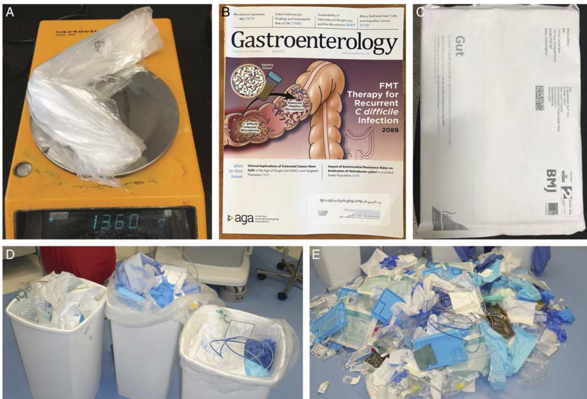
FIGURE 2. Conversion of plastic journal covers to paper, and waste generated by endoscopy procedures. A, The plastic covers of 2 typical journals weigh 13.6 g. B and C, Some of the major gastrointestinal journals have switched from using plastic covers to either paper labels ( Gastroenterology ) or a paper cover ( Gut ). D, Three bins of endoscopy-generated waste from an endoscopy unit in Melbourne, Australia (for 9 colonoscopies with polypectomies and 1 upper endoscopy, excluding the suction and drainage tubing and canisters). The bins shown in (D) were then weighed after emptying their contents (E). The net weight of waste per procedure was 0.54 kg.