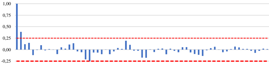
Chart: 3 Autocorrelation Function (ACF)

Table 3 gives the results of the Breusch-Pagan-Godfrey test, which was performed to determine whether the estimated model has a problem of varying variance. As shown below, since the Chi-Square value is more significant than 0.05, the null hypothesis that the variances of the error terms are equal cannot be rejected (Breusch & Pagan, 1979). That is, there is no problem of varying variance in the model.