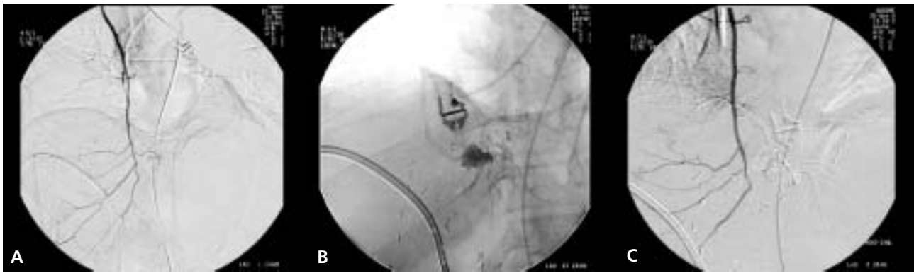
Figure 1. A 26-year-old woman who had undergone a living-related liver transplant with a right lobe graft. A. Selective right internal mammary artery injection shows contrast extravasation of the medial distal branch. B. Superselective angiography with microcatheter demonstrates the active bleeding site. C. Postembolization arteriography after glue injection demonstrates occlusion of the bleeding artery.