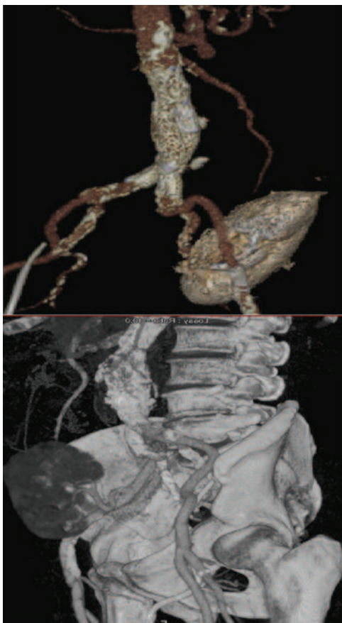
Figure 3. 3-Dimensional CT Scan Showing the Prosthesis Positioned to Preserve Kidney Vascolarization

Renal transplant patients affected by ADPKD deserve annual AAA screenings to prevent rupture and emergency surgery. Abdominal aortic aneurysms with a diameter greater than 5.5 cm represent the cutoff value, above which, AAA repair becomes mandatory. All attempts to repair smaller AAA through an endoscopic approach in fit patients, do not seem to have any effect on the overall outcome. This idea also has been proposed by others regarding renal transplant patients tout court. 14 The role of matrix metalloproteinases in the progression of AAA has, in fact, been demonstrated in animal models and clinical studies. 3 It also is well known that an association between ADPKD and AAA exists; however, no precise data regarding its actual incidence have been determined, with only rare cases