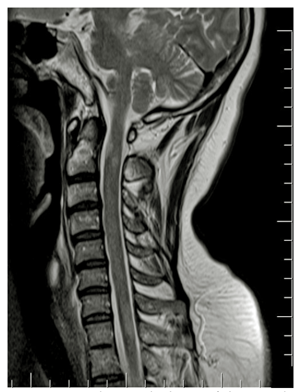
Figure 2. Sagittal T2-weighted MRI of the cervical spine showing chronic demyelinating lesions at the levels of C2 and C7-T1.

The patient was consulted to our physical medicine and rehabilitation outpatient clinic due to complaints