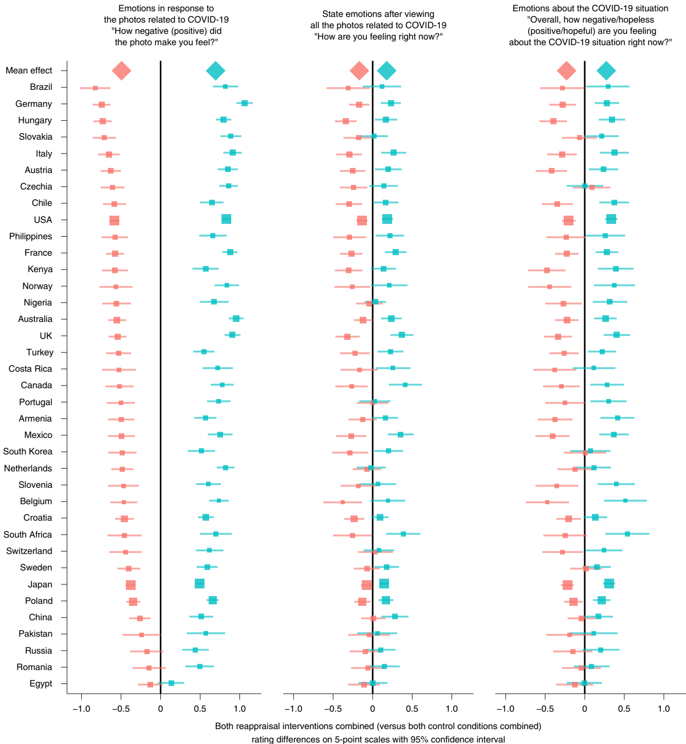
Fig. 1 | Effect sizes of both reappraisal interventions combined (versus both control conditions combined) on primary outcomes by country/region.

Valence ◆ Negative ◆ Positive Sample size ■ 200 ■ 800 ■ 2,400