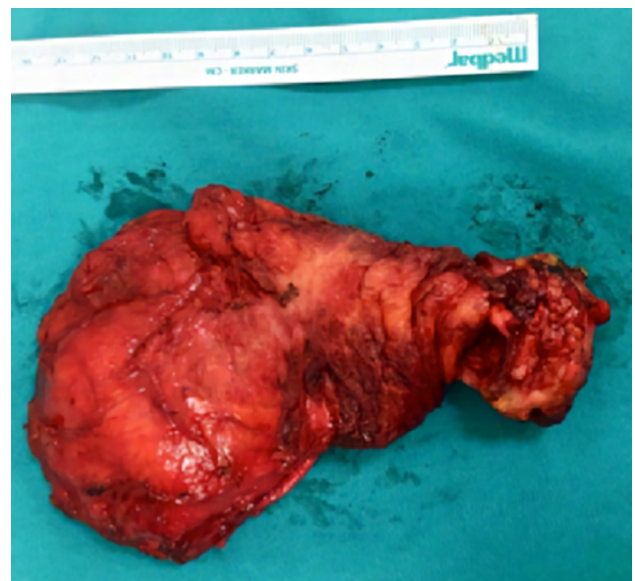
FIGURE 2. Postoperative macroscopic appearance of mass.