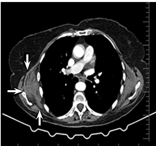
FIGURE 1. Thorax computed tomography.

In this case, the patient was one of the rare few who suffered from shoulder and back pain due to ED. Not only were the symptoms of back and right shoulder pain significant enough to affect the patient's quality of life, they had become progressively worse over time and were even affecting her sleep quality. Despite this, the diagnosis of ED was overlooked. The