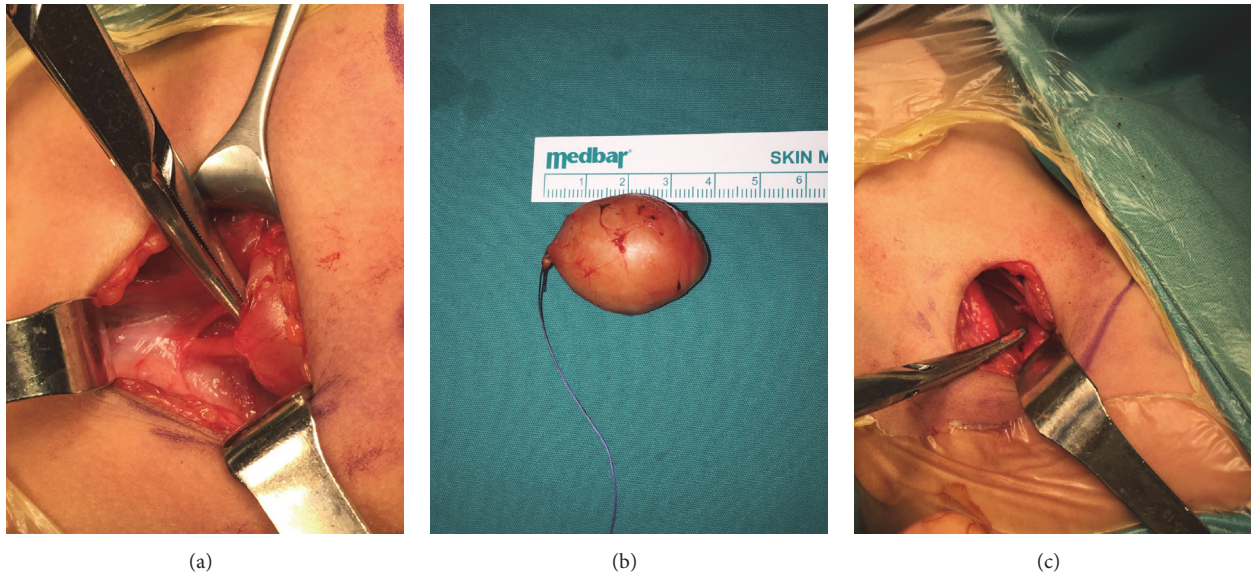
FIGURE 2: (a) Intraoperative view of the neurogenic mass. (b) The lesion with 4 cm size after the total excision. (c) Upper part of the nerve was held by the clamp.