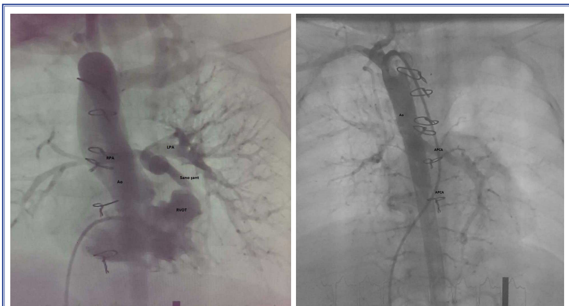
Figure 2. (A) Catheter angiogram demonstrating inadequately developed pulmonary arterial bed for complete correction, and unifocalization surgeries, and two collateral arteries stemming from aorta. (B) Catheter angiogram demonstrating inadequately developed pulmonary arterial bed for complete correction, and unifocalization surgeries, and two collateral arteries stemming from aorta.

Though considered as a term defining only pulmonary valvular pathology, pulmonary atresia also demonstrates its effects on all cardiac structures mainly left ventricle. In VSD patients with PA, very variable pulmonary artery circulation, and anatomy are the most effective determinant of natural course of this pathology, and treatment approach. Pulmonary circulation can be achieved with patent ductus arteriosus, and collaterals between coronary, and pulmonary arteries. Size of pulmonary artery, and its branches, presence