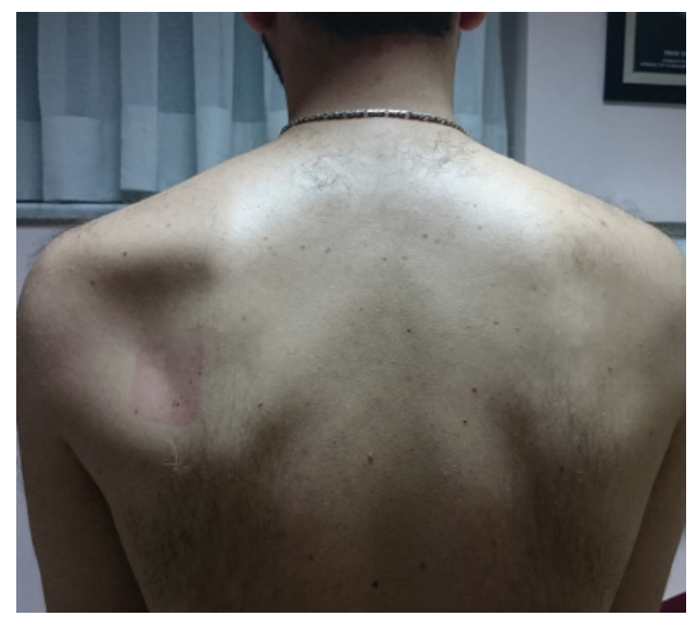
Figure 1. The pre-treatment appearance of left infraspinatus and supraspinatus muscle atrophy

Investigations revealed normal posteroanterior chest and left shoulder radiographs. Routine blood tests were also within the normal range. Left shoulder MRI showed tendinitis in supraspinatus tendon, diffuse edema and some atrophy of the supraspinatus and infraspinatus muscles together with minimal fluid in the subdeltoid, subacromial and subscapular bursae (Figure 2a, 2b). With these findings in mind electrophysiological examination was performed.