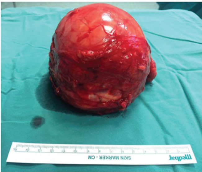
Figure 2. Macroscopic appearance of adrenal gland