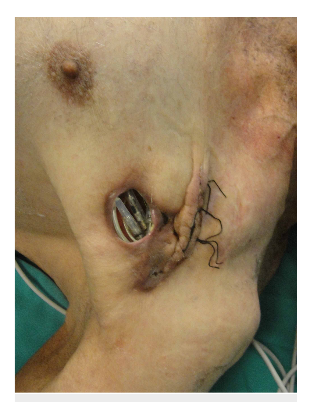
FIGURE 7: Pre-operative view of the exposed CIED

CIED: cardiac implantable electronic devices