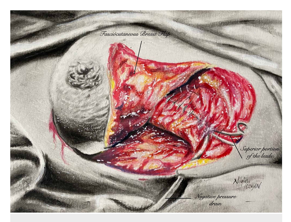
FIGURE 2: Illustration of elevated large fasciocutaneous pectoral skin flap which makes the second layer of closure. Tip of the flap was deepithelized and sutured over superior part of the leads.

The flap was elevated from the pectoralis major fascia after local anesthetic injection. Perforators from the pectoralis major muscle were preserved if they were not restricting rotation advancement. The tip of the flap was de-epithelized and advanced subcutaneously over the subclavicular portion of the leads, which could not be buried under the muscle. Two negative pressure drains were placed under the skin flap, and one drain was placed under the muscle for hematoma prevention.