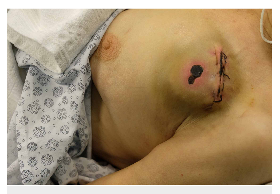
FIGURE 3: The patient had skin necrosis over implantation site and hematoma formation around the implanted device.

The cardiology department referred an 85-year-old female patient for skin necrosis over her pacemaker. She had decompensated heart insufficiency, and the cardiac pacemaker that she had for three years needed a replacement one month ago. The skin over the pacemaker site had 2x1 cm demarcated skin necrosis and perinecrotic inflammation (Figure 3).