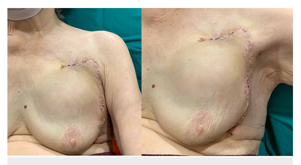
FIGURE 6: Postoperative second-month image of the patient; patient did not complain of any restriction or discomfort during shoulder movements

A closed incisional negative pressure wound therapy (ciNPWT) was started immediately after the suturation of the operation site. Drains were removed on the fifth postoperative day. CiNPWT was applied for three sessions. No flap necrosis or dehiscence was encountered. Figure 6 demonstrates the postoperative second-month image of the patient.