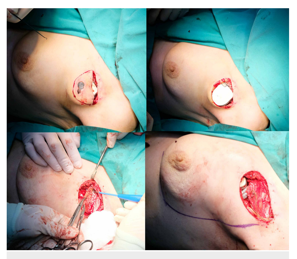
FIGURE 4: (Top) All the inflamed, unhealthy tissues were excised; (bottom left) capsule formation around the device was also derided over the pectoralis muscle; (bottom right) flap borders were marked after placement of CIED under pectoralis major muscle

and hyperemic skin was excised. Capsule formation was debrided carefully with the supervision of the attending cardiologist. A 3-cm-long transverse incision was made on the pectoralis major muscle, and a blunt dissection was made under the pectoralis muscle to prepare a submuscular space for the device (Figure 4).