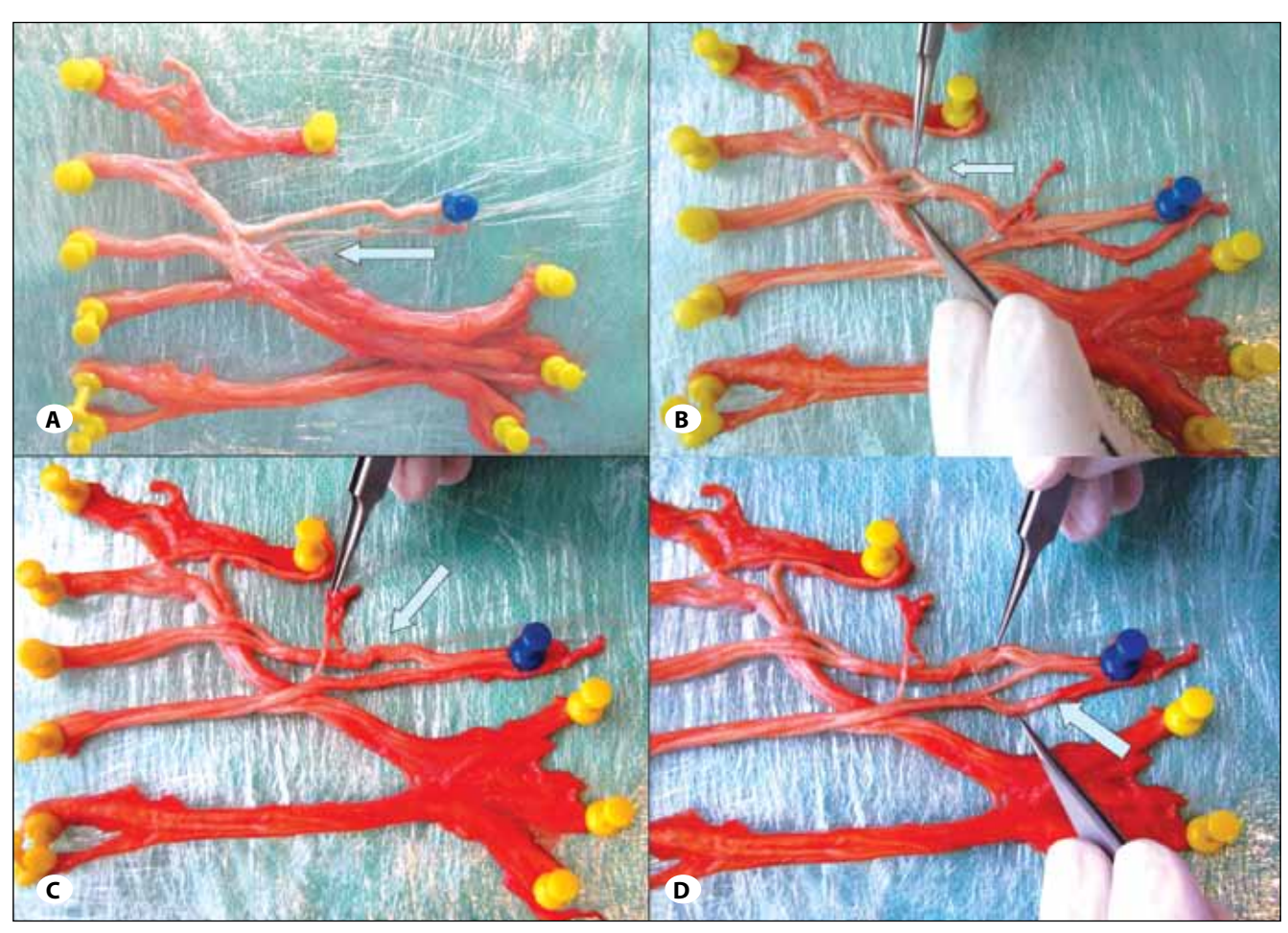
Figure 2: Brachial plexus extracted. A) Arrow shows fascicles from the trunks uniting to form divisions. Blue pin: Suprascapular nerve. B) Arrow shows fascicles being dissected by teasing method. Blue pin: Musculocutaneous nerve. C) Musculocutaneous nerve was dissected into its fascicles and traced back to the nerve roots. Blue pin: Musculocutaneous nerve. D) Fascicles were separated and their spinal root origins were determined. Blue pin: Musculocutaneous nerve.