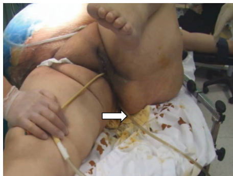
FIGURE 4: Intrarectal NPT was shown by arrow.

to be the most important risk factors [12]. In our case, she was elderly, morbid, obese patient with DM and CLD. She had complicated recurrent giant hernia, although she underwent operation for IH 6 times. Duration of strangulation is the most important determinant of the outcome regarding gut viability, resection-anastomosis rate, morbidity, and mortality [13]. Andrews noted a mortality rate of 1.4%, 10% and 21% when strangulated hernia presented within 24 hours, 24–48 hours, and after 48 hours, respectively [14]. In our case duration of strangulation was more than 96 hours and there was severe peritonitis with necrosis and perforation of small bowel at the first operation.