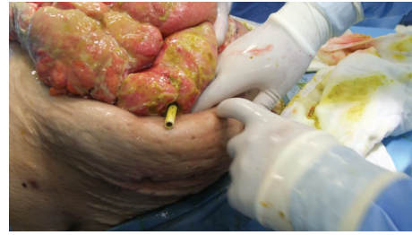
FIGURE 1: Pezzet drain is seen in EAF.

At postoperative 9th day, after EAF development, she was consulted and transferred to our clinic. Her general condition, consciousness, and orientation were not well. She was mechanically ventilated. Her vital parameters, intra-abdominal pressure (IAP), SOFA score, and estimated mortality rate were shown in Table 1. She was in septic shock and mild metabolic acidosis (Table 2). She underwent emergent reoperation. There was very wide OA wound (70 * 60 cm in diameter) with high output enteric fistula and severe visceral adhesion. All intestine was very edematous and fragile and according to new modified Björck classification OA score of the patient was 2c score [9]. All the intra-abdominal content was irrigated with saline. Perforation point of ileum was seen at the previous anastomosis side (Figure 1). A pezzet drain was inserted in the EAF and redirected to the place where ileostomy was planned to open. Glycerin-impregnated