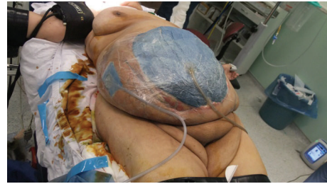
FIGURE 2: Two NPTs are seen.

gauze was used around EAF and pezzet drain tube to support segmentation of ostomy side from OA wound. Two NPT systems were applied; one was standard abdominal NPT (Figure 2), and the second one was performed on the ileostomy opening where the EAF was directed with pezzet tube. Synchronized negative pressure was applied to both NPTs [10]. The second NPT on ostomy place was changed 3-4 times a day.