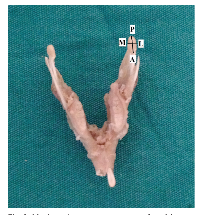
Fig. 2. Morphometric measurements were performed between the protruding front and rear points of mandible condyle (anteroposterior, A-P), and the other was performed at the ends of the protruding lateral sides of the mandibular condyle (M-L mediolateral) using a digital caliber.

After dissection of the masseter and temporal muscles, the mandible was completely cleared from the surrounding tissues. Right and left mandibular condyles were used to investigate the changes in size. Osteometric measurements were obtained using four different points on the mandibular condyle. One of these measurements was performed between the protruding front and rear points of mandibular condyle (anteroposterior, A-P), and the other was performed at the ends of the protruding lateral sides of the condyle (mediolateral, M-L) (Fig. 2). Morphometric measurements were performed with 1 mm precision, using a digital caliber.