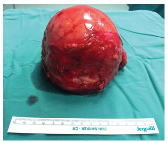
Figure 2. Macroscopic appearance of adrenal gland