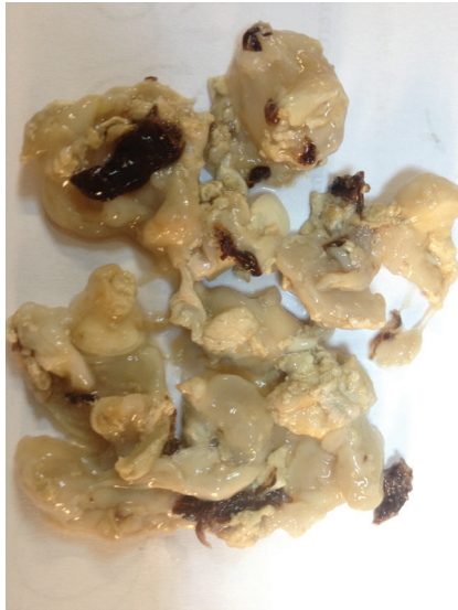
Figure 2. The image of hydatid cyst material