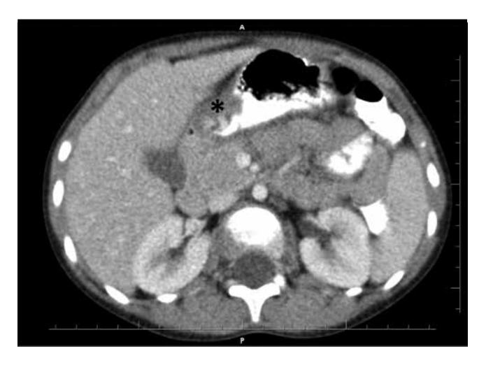
Figure 3. Preoperative computed tomography: Soft tissue thickening at the anterior wall of stomach and pylorus (asterisk); the widest segment was 19×12 mm

these patients, 4 patients [1-week-old boy (4), 13-day-old boy (5), 1-month-old girl (1), and 4-month-old girl (3)] were misdiagnosed as having hypertrophic pyloric stenosis. The presence of gastric duplication cyst was considered in differential diagnosis of a 5-year-old girl whose clinical and radiological findings were similar to our case (2). These pathologies are more frequent at etiology of vomiting in the pediatric age group (1-5). A misdiagnosis may lead to a delay in the excision of the mass and pathological diagnosis. USG or CT of all the reported cases showed cystic or heterogenous in-