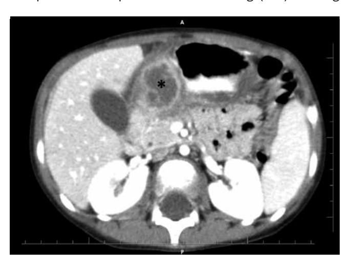
Figure 1. The initial computed tomography image: A cystic lesion (asterisk) measuring 30×28 mm at the gastric antrum

Previously, five pediatric cases of gastric adenomyoma have been reported in the literature. The major complaint of the patients was vomiting (1-5). Among